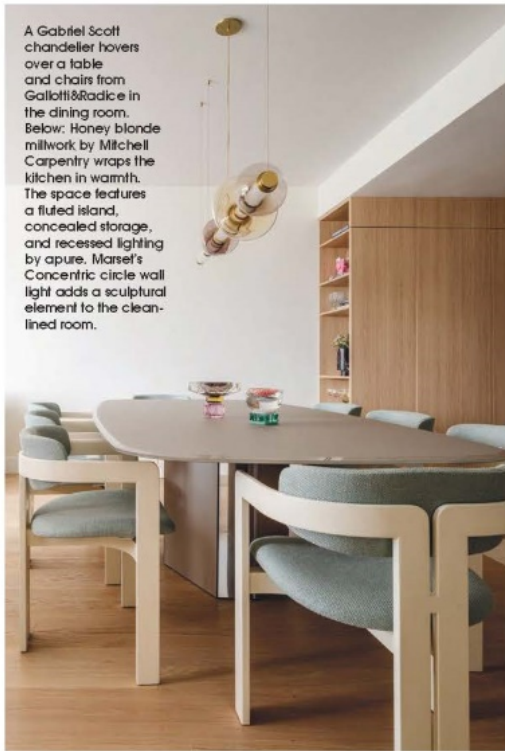
A Gabriel Scott chandelier hovers over a table and chairs from Galotti&Radice in the dining room. Below: Honey blonde millwork by Mitchell Carpentry wraps the kitchen in warmth. The space features a fluted island, concealed storage, and recessed lighting by apure. Marsel's Concentric circle wall light adds a sculptural element to the clean-lined room.

the kitchen, living and dining areas into one cohesive interior where each space speaks to one another. "The kitchen is very special since it is the heart of the house," says Uribe, noting it divides the public spaces (living and dining areas) from the private spaces (the four bedrooms and bathrooms).